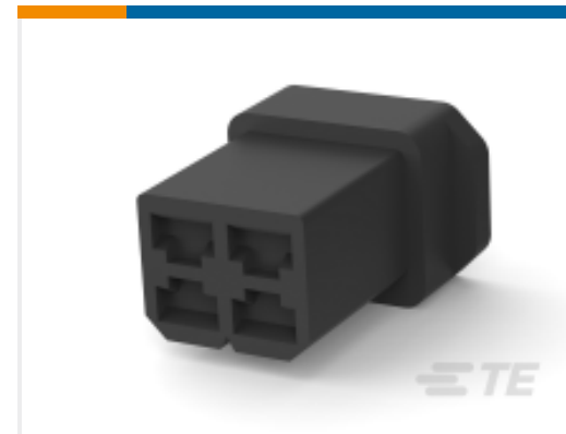
TE Part # 626056-4 FASTIN-ON .110 HOUSING REC PRETO/BLACK