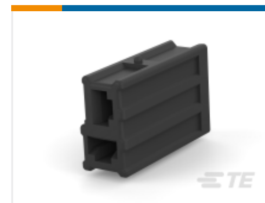
TE Part # 626064-5 ISOLADOR