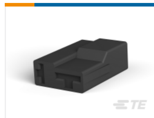
TE Part # 281993-3 FF 250 & 375 REC HSG 2P NYLON BLACK